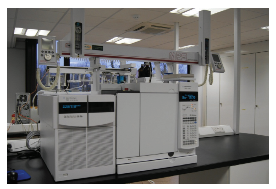
Figure 2. An Agilent GC 7890A GC and 7000 MS triple Quad with MPS 2 XL (Dual Head) CIS Multiflex Inlet used to determine environmental pollutants in water.

system works by passing nitrogen gas into a sealed headspace vial forcing volatile materials onto a sorbent trap (typically Tenex). The trap is then transferred into the GC injector and desorbed using a temperature program. Compared to static headspace, this approach demonstrates much improved analyte transfer and therefore detection sensitivity. Extremely small liquid samples can be anlaysed by this approach. By using a large excess of the volatilising gas, trace levels of components can be dramatically concentrated and allows the analysis of volatile, non-volatile and hydrophilic analytes. An example was presented where Jagermeister components were sampled using SPME, SBSE static HS and DHS with DHS demonstrating the best results.