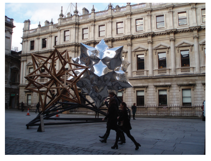
Venue for the Emerging Separation Technologies Meeting – Burlington House, London. The home of the Royal Society of Chemistry.

important innovations in the GC field. In this respect, the separationpower leaps from the packed to the capillary column, and from the latter to GC×GC, are comparable. The talk covered the principles of GC×GC and GC×GC-MS and then discussed the group's present research work which focuses on the combination of GC×GC systems with recent mass spectrometry (MS) instrumentation, such as rapidscanning quadrupole (Q) and triple quadrupole (QQQ) MS. It was shown that such powerful separation-science tools are unified ones in as much that they can cover practically all the requirements of an untargeted, targeted or fingerprint-based application. The present state-of-the-art of advanced GC×GC-MS instrumentation was illustrated with several applications involving complex samples (Analysis of Allergens in Perfume, Headspace solid-phase microextraction GC×GC-qMS analysis of pesticides in drinking water and finally the analysis of sulphur compounds in coal tar using on-line LC-GC×GC combined with QQQ MS. He discussed various potential future scenarios such as new stationary phases (e.g. ionic liquids) and compatibility of MS for the analyte classes could further extend the application of comprehensive 2D GC.