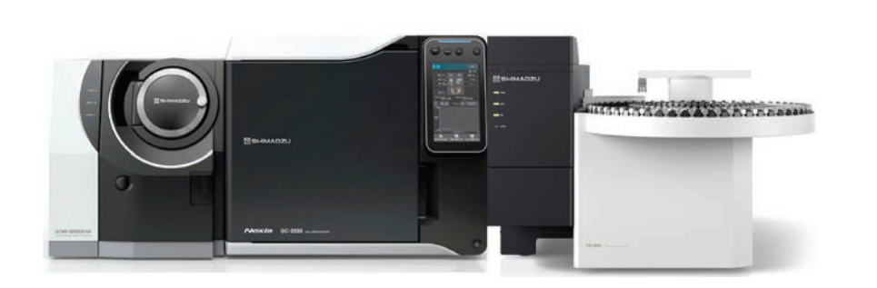
Figure 1. TD-30R + GCMS-QP2020 NX.

In the TD-30R thermal desorption instrument, the sample gas collected within a sample tube is thermally desorbed and then concentrated in a cold trap before injection into the GC-MS. In theTD-30R, there is a retrapping function that collects the split sample gas again in a tube, and a function that automatically adds the internal standard. Using this retrapping function reduces the risk of analysis failure. In addition, the value calculated by the retrapping function can be corrected by using this function together with the internal standard auto addition.