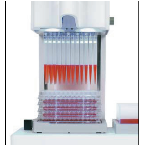
Figure 3. Repeat Dispensing allows quick filling of multiple plates.