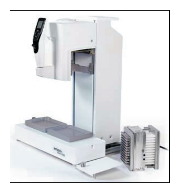
Figure 2. Convenient exchange of a pipetting head.

Electronic 96-/384-channel pipettes can also calibrated using a photometric procedure, a method that can be carried out in most labs.