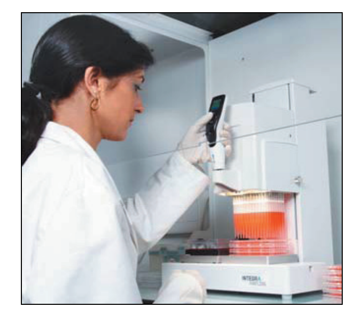
Figure 4. Pipetting in a laminar flow hood.