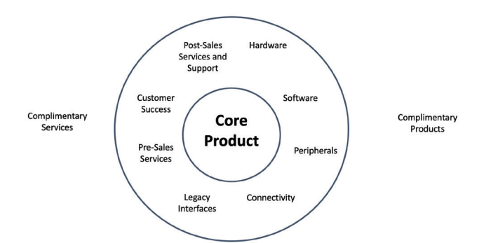
Figure 2: Understanding that a new core technology or concept is not everything that is being sold is an important concept. This figure shows some of the other considerations to ensure that new technology is sold successfully.

Once the vendor has taken control of one market, then the vendor can look to break into other markets, using a similar approach. This typically results in a very fast growth of sales as the new markets take up the safe reliable solution very readily. Eventually this will result with the new technology becoming the mainstream technology, and within the chromatography environment there are quite a few examples of new technologies that have been introduced very successfully using a similar approach to this, including UHPLC and solid core silica column packing materials. There are, unfortunately, many technologies where the implementation has not been so successful.