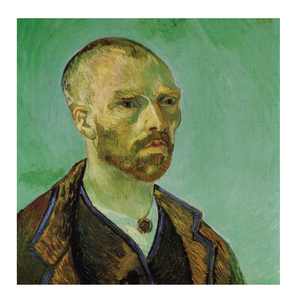
Figure 1. Vincent van Gogh used highly toxic copper(II) acetoarsenite as a green background colour in his paintings. The illustration is a self-portrait of the artist which he dedicated to Paul Gauguin.

Figure 2. Arsenic is not usually to be found in its pure form in nature. One of the compounds frequently encountered is realgar (As4S4), here seen on a substrate of stibnite and granite.